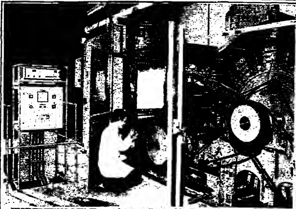
HIGH TECHNOLOGY: The very latest carding machine for combing wool and cotton is installed in a Scottish textile factory. It uses radio isotopes and microtechnology to measure the density of the wool, to ensure that each of the 180 fiber ends which the machine produces is identical in fiber content and density, providing complete uniformity.

Based at Haddenham, Buckinghamshire, the company will specialize in solar applications for which other energy systems offer no practical alternative. These are likely to include communications, transport signaling and civil engineering projects in remote loca-